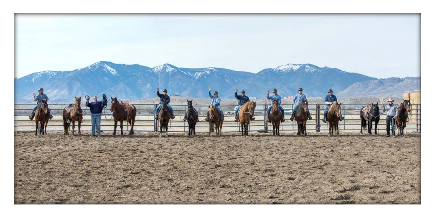
Saturday, February 24, 2018

13 Saddle-trained Wild Horses available for Adoption